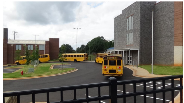
Buses ready to roll at Granite Falls Middle School