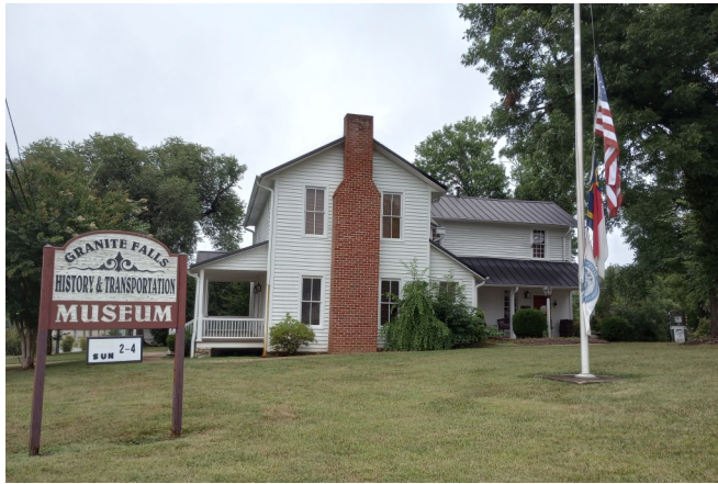
(ANNUAL MEETING continued from page 1)

and include photos in the slide presentation.